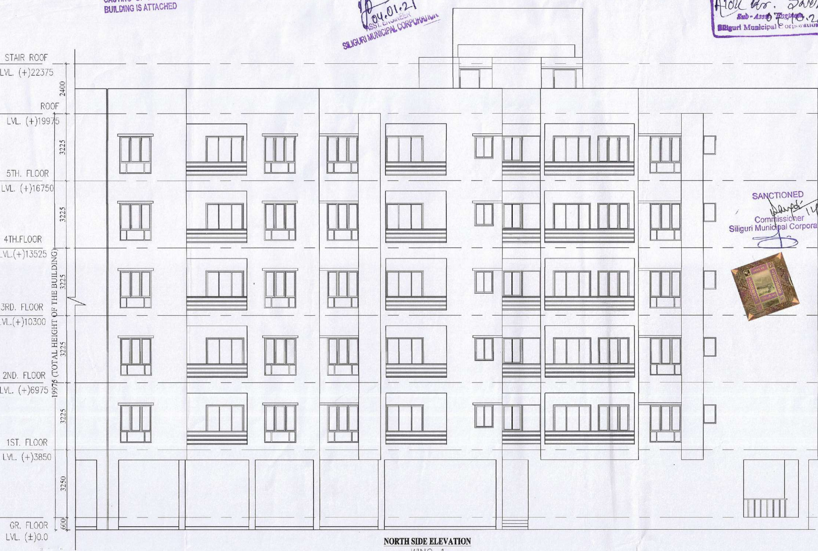
NORTH SIDE ELEVATION WING-1

Note:- Structural Details shall be followed as per 'Approved' Marked Copy.