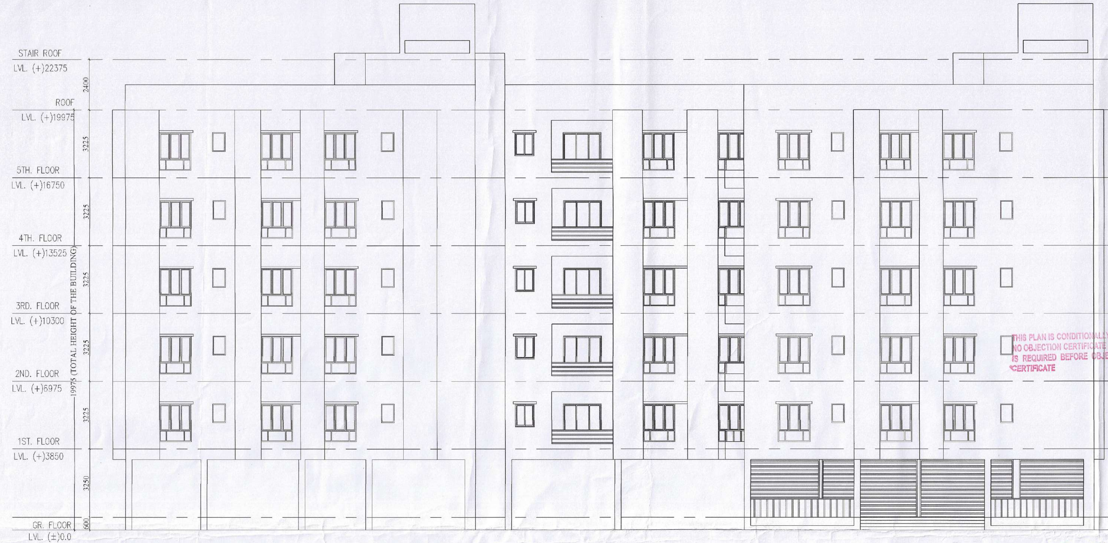
FRONT ELEVATION WNOCK-1

MASS & VOID ARCHITECTS/INTERIORS 4B, 4th floor, Ektaa Hibiscus, 56, Christopher Road, Kolkata 700 046 P +91 33 2328 2264 +91 90 3800 3186 E mava2003@gmail.com W www.massandvoid.com